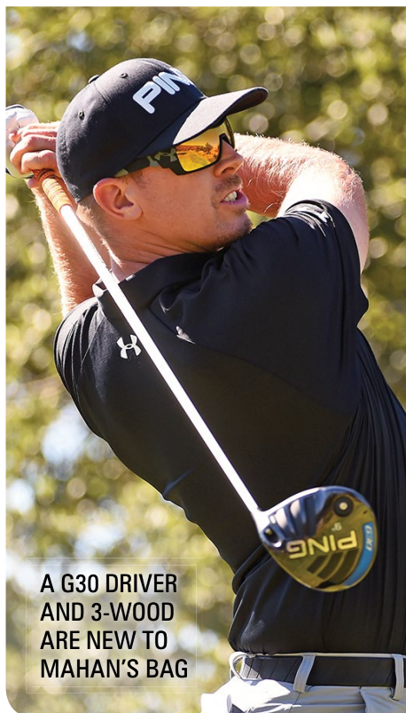
A G30 DRIVER AND 3-WOOD ARE NEW TO MAHAN'S BAG

E quipped with the G30 driver that helped propel him to two playoff victories and a FedExCup Championship, Billy Horschel begins his 2014-15 season this week at the Shriners Hospitals for Children Open in Las Vegas. Over his final six starts last season with the G30 driver, he gained 12 yards in distance, added ball speed and won twice. Horschel, #13 in the Official World Golf Ranking, is the highest-ranked player in the field. See PING's complete Shriners roster on the next page.