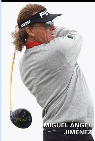
MIGUEL ÁNGEL JIMÉNEZ