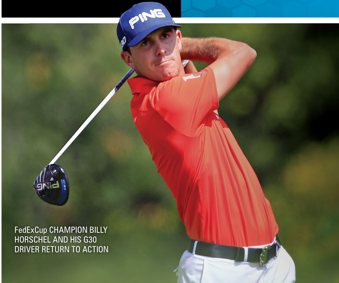
FedExCup CHAMPION BILLY HORSHEL AND HIS G30 DRIVER RETURN TO ACTION