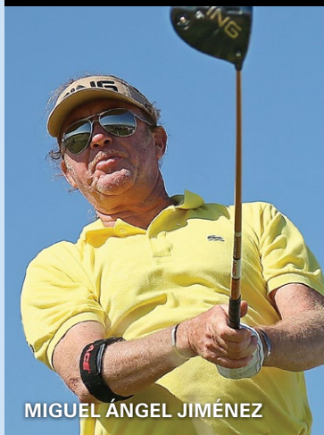
MIGUEL ÁNGEL JIMÉNEZ